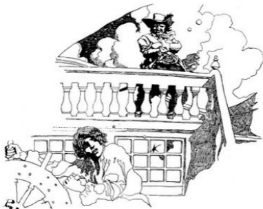
"OUR HERO, LEAPING TO THE WHEEL, SEIZED THE FLYING SPOKES"

In a moment the ship would have fallen off before the wind had not our hero, leaping to the wheel (even as Captain Morgan shouted an order for some one to do so), seized the flying spokes, whirling them back again, and so bringing the bow of the galleon up to its former course.